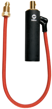
50 mm Dinse-Style with Water Return Line 195377

For Dynasty 210/300/400, Maxstar 210/280/400 and Syncrowave 300/400. Used with all Weldcraft™ water-cooled torches.