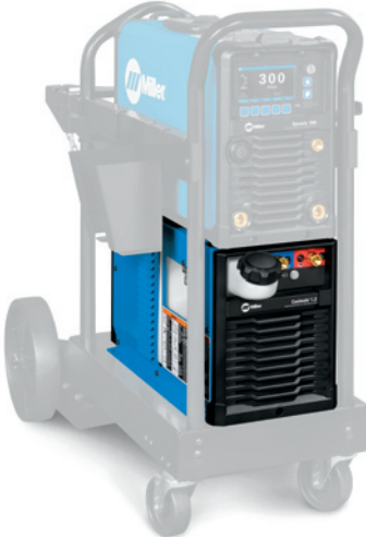
Coolmate 1.3 shown with Dynasty® 300 TIGRunner®