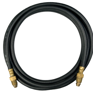
Water Hose Extension 40V76R6

6 ft. (1.8 m). Hose with two male 5/8-inch 18 LH thread connections.