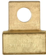
Water-Cooled TIG Block Adapter 45V11

For Dynasty 800. Used with all Weldcraft™ water-cooled torches.