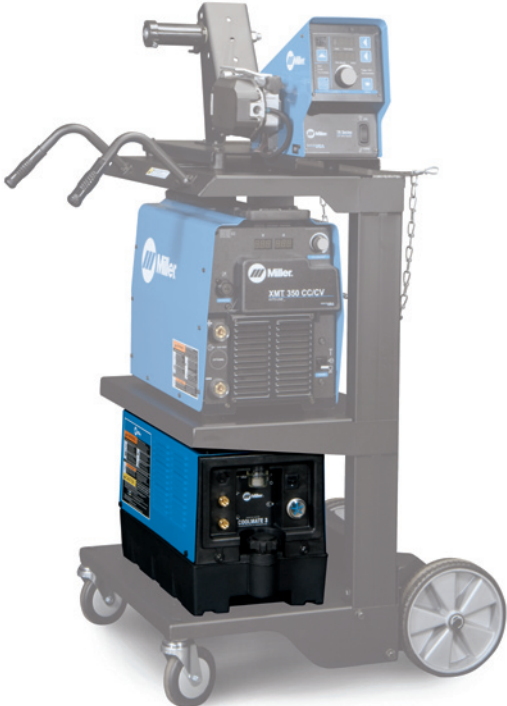
Coolmate 3 shown with XMT® 350 MIGRunner™