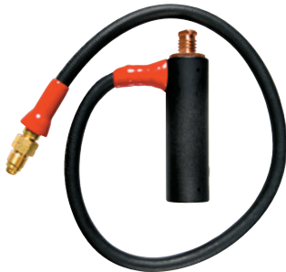
50 mm Thread-Lock-Style 225028

Adapts machines with flow through gas valves to coolers.