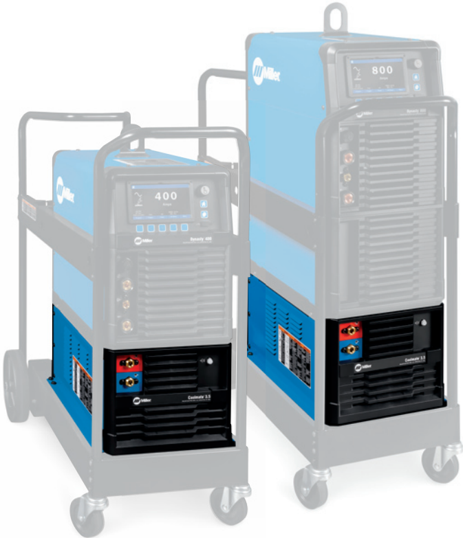
Coolmate 3.5 shown with Dynasty® 400 TIGRunner® and 800 TIGRunner®