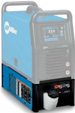
Coolmate™ 1S shown with Syncrowave® 212