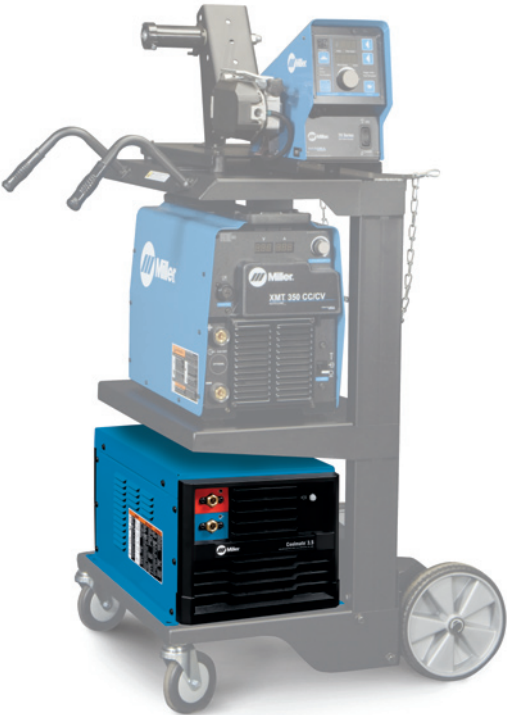
Coolmate 3.5 shown with XMT® 350 MIGRunner™