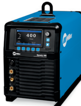
Dynasty 400 Machine only